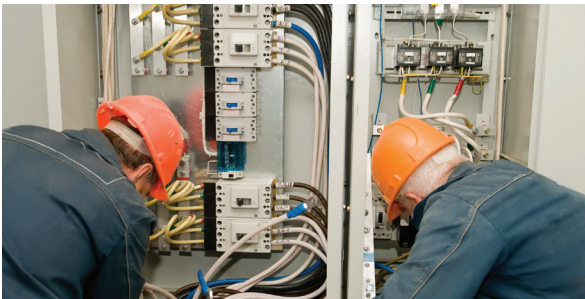
INDUSTRIAL CONTROL PANELS