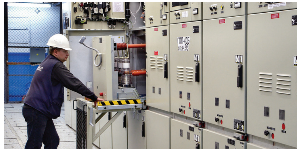
MOTOR CONTROL CENTERS