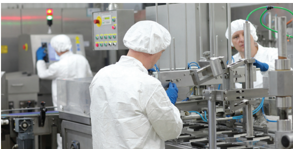
PRODUCTION LINE EQUIPMENT CABINET