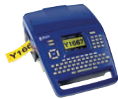
BMP™71 LABEL PRINTER