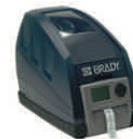
IPT Series PRINTER