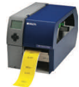
BradyPrinter™ BP-PR PLUS Printer HEAVY DUTY MEETS HIGH TECH