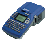
BMP™51 LABEL MAKER