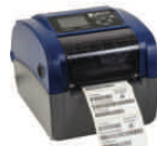
BBP™12 LABEL PRINTER