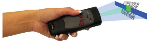
Optimal distance from code is 3.3" (85mm).

CR2500's unique targeting function uses two converging targeting LEDs to guide the user to optimal reading range.