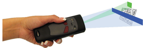
Too far from code.