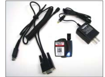
RS-232 Cable (Left), CodeXML M3 Bluetooth® Modem (Center), Power Supply (Right)

Change Baud Rate Settings: Scan the appropriate code below, after connecting to the modem: