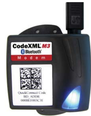
CodeXML M3 Bluetooth® Modem

The CodeXML M3 Bluetooth® Modem is 'plug & play.' You simply plug-in the Modem, scan the QuickConnect code on the Modem label and start transmitting data from Code Readers without downloading any drivers or software. The Modem can receive Bluetooth signals from up to 300 feet (100 meters) away.