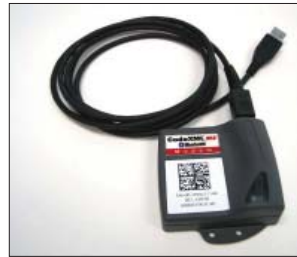
USB Cable installed to CodeXML M3 Bluetooth® Modem