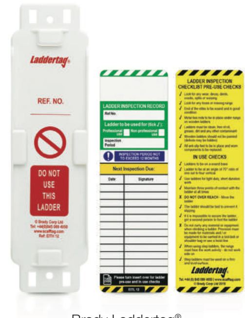
Brady Laddertag® Visual Tagging System

Recommended; 3 months external, 6 months internal, maximum 1 year.