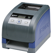
BBP®33 Label Printer

Save time using the list functionality which allows you to export asset and cable information from NetDoc to a CSV file. Place the CSV file on a USB to import the data into the BMP61 for quick label creation.