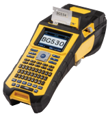
BMP®61 Label Printer

Save time using the list functionality which allows you to export asset and cable information from NetDoc to a CSV file. Place the CSV file on a USB to import the data into the BMP61 for quick label creation.