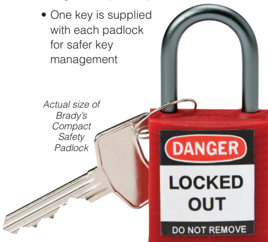
Actual size of Brady's Compact Safety Padlock

When keyed alike, all locks in a set can be opened with the same key. This option is beneficial when multiple locks are assigned to a single employee.