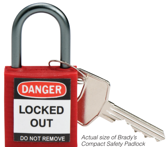
Actual size of Brady's Compact Safety Padlock