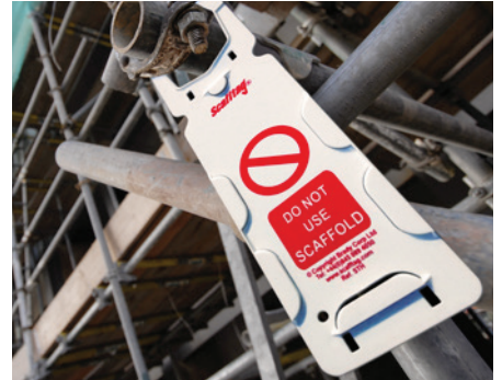
Scafftag® Scaffold Management