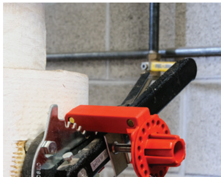
Ball Valve Lockout Devices