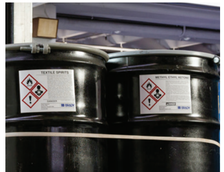
BS 5609 Compliant GHS Labels