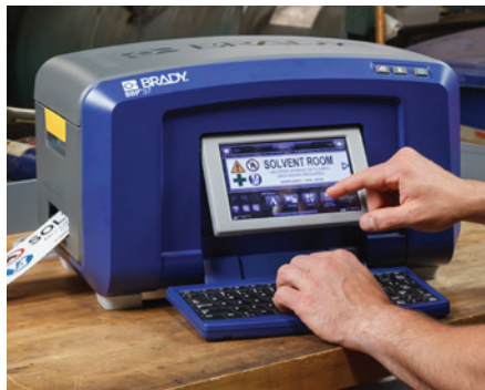
On-Demand Sign and Label Printers