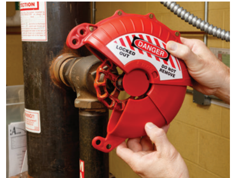
Collapsible Gate Valve Lockout Devices