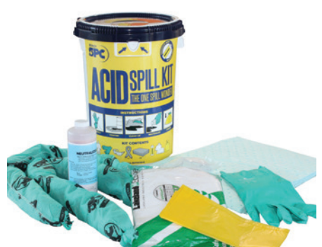
Spill Response Kits