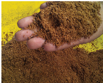
SpillFix® Granular Absorbent