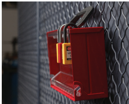
Group Lock Boxes