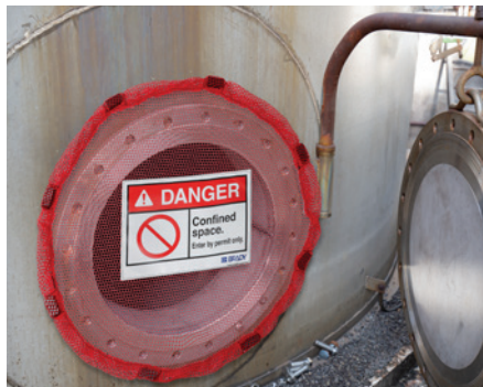
Confined Space Safety Covers