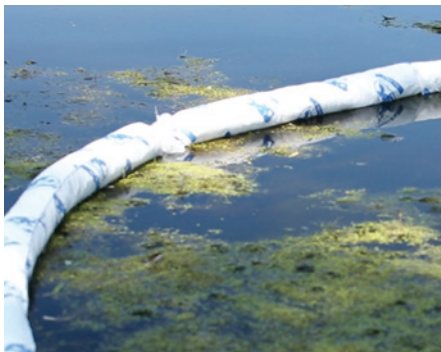
Absorbent Booms and Pillows