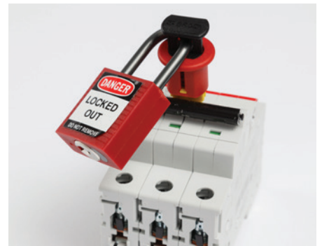
Circuit Breaker Lockout Devices