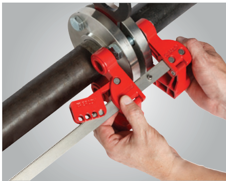
Blind Flange Lockout Devices