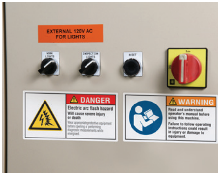
Arc Flash Labels