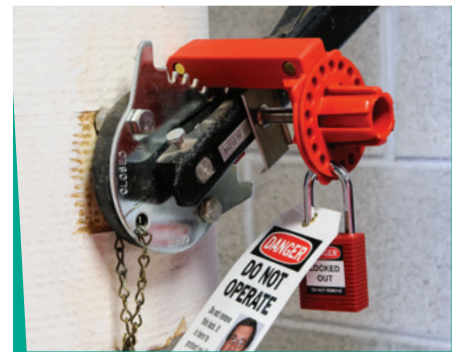
Butterfly Valve Lockout Devices