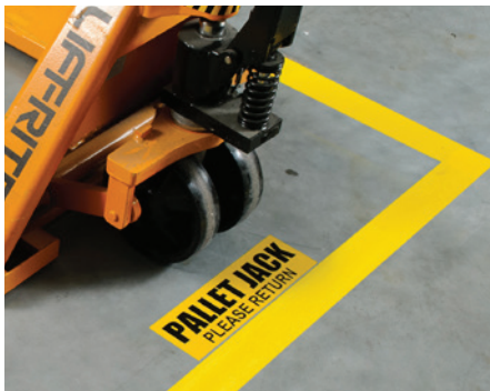
ToughStripe® Floor Marking