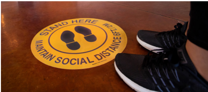
Floor marking is available in different shapes and sizes.