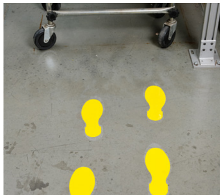
Organise one-way directional traffic in your warehouse or backoffice.