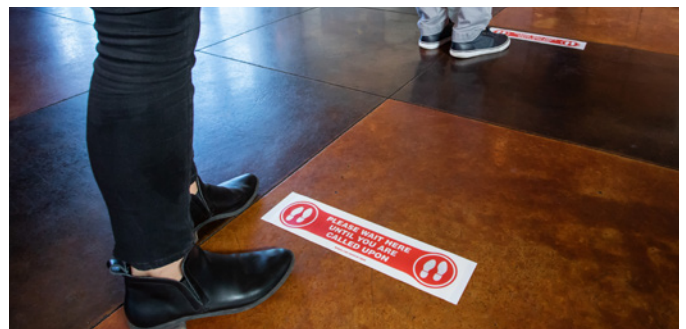
Offer your customers clear safety instructions.