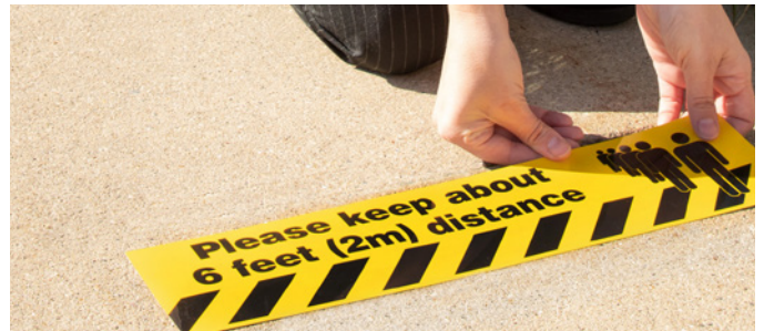
A range of adhesives and application technologies is available to suit most floor or wall types.