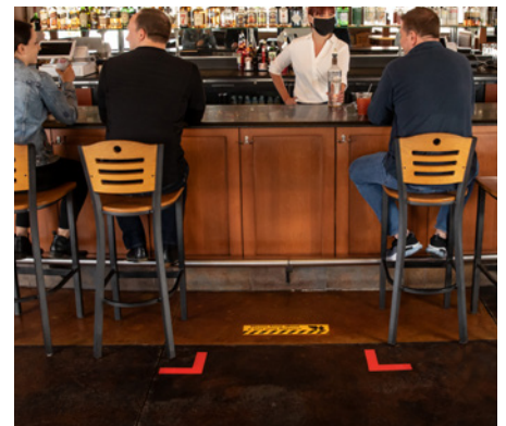
Visually indicate safe distances that are fast & easy to understand.