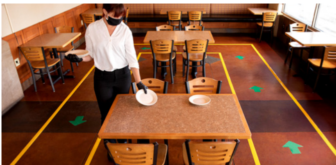
Effortlessly create safe, one-way traffic routes.