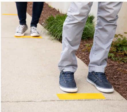
Easily enable social distancing for queues.