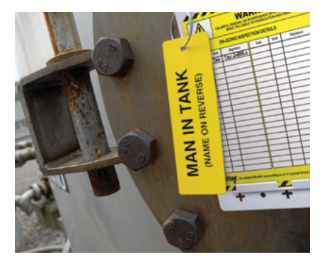
© 2019 Brady Worldwide Inc. All rights reserved.