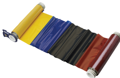
Four Color Paneled Print Ribbons